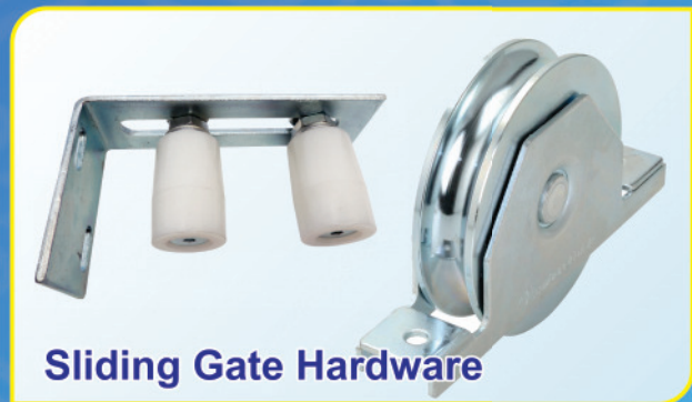
Sliding Gate Hardware